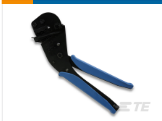
TE Part # 1SET191002R0000 TET CRIMP-HT