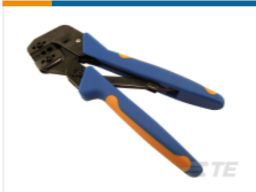
TE Part # 1SET191001R0000 CRIMP-HT