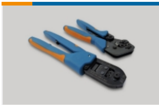
Hand Crimping Tools(2)