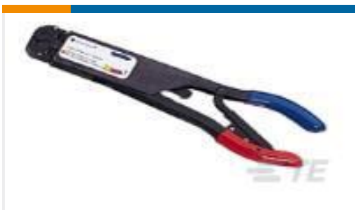
TE Part # 59300 T-HEAD PIDG PG 26-16 ASSY