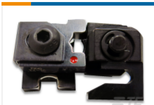
TE Part # 47806-2 DIES PIDG 22-16 DIE SET